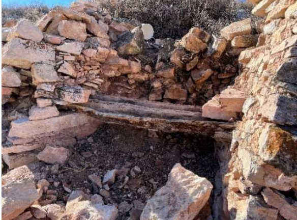
of Chris Figge)

Support beams exposed after the disassembling of the