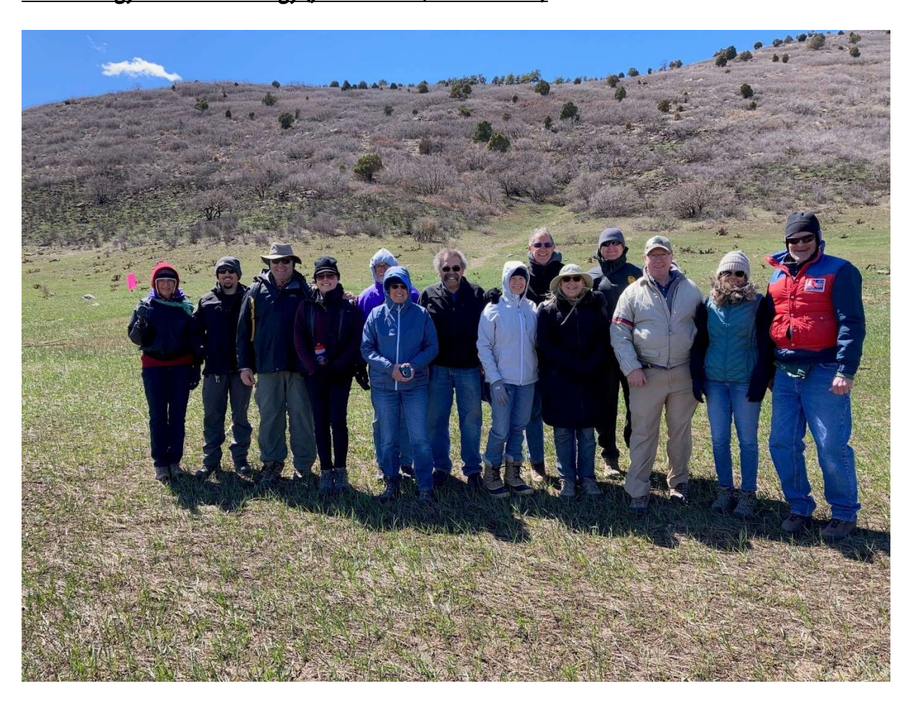
Oak Fire Burn Site