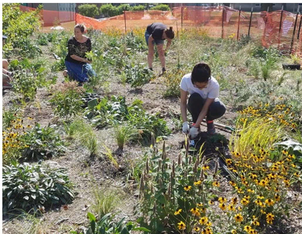
DEMONSTRATION AND NATIVE GARDEN