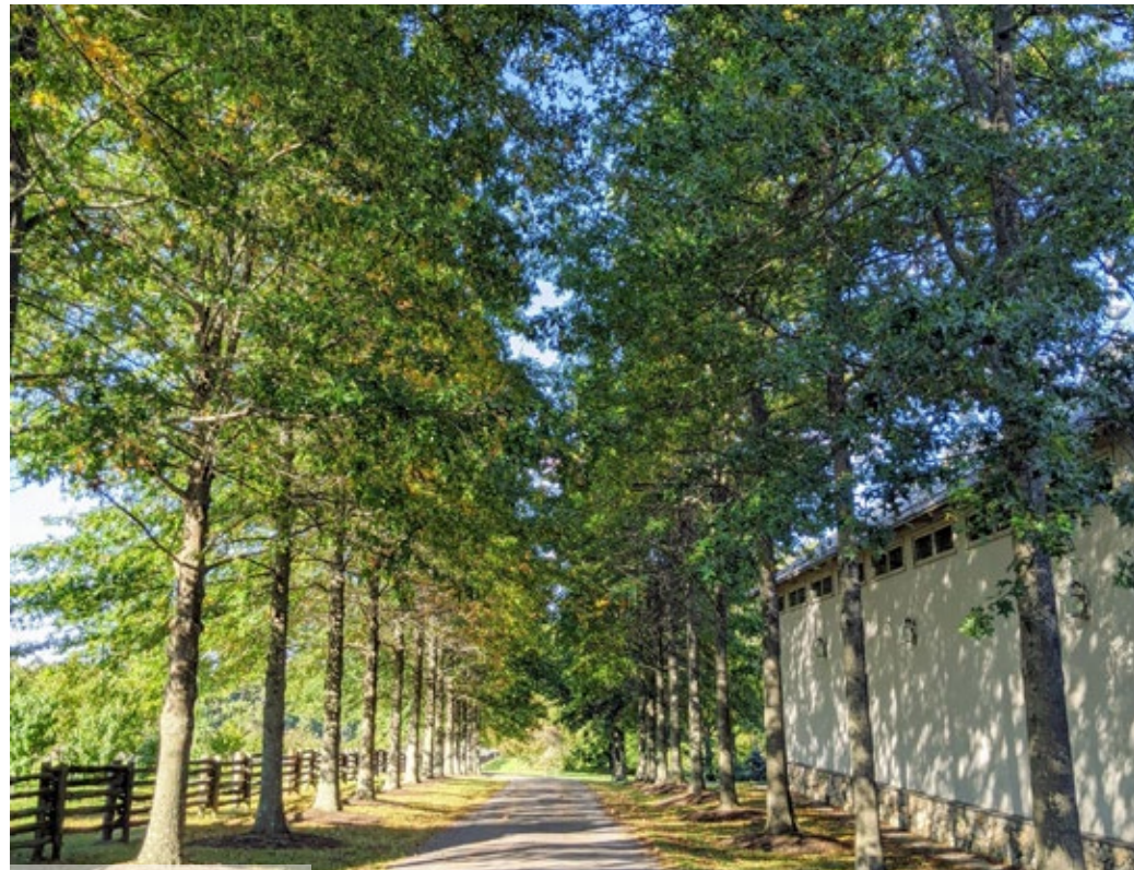
ALLEE OF TREES