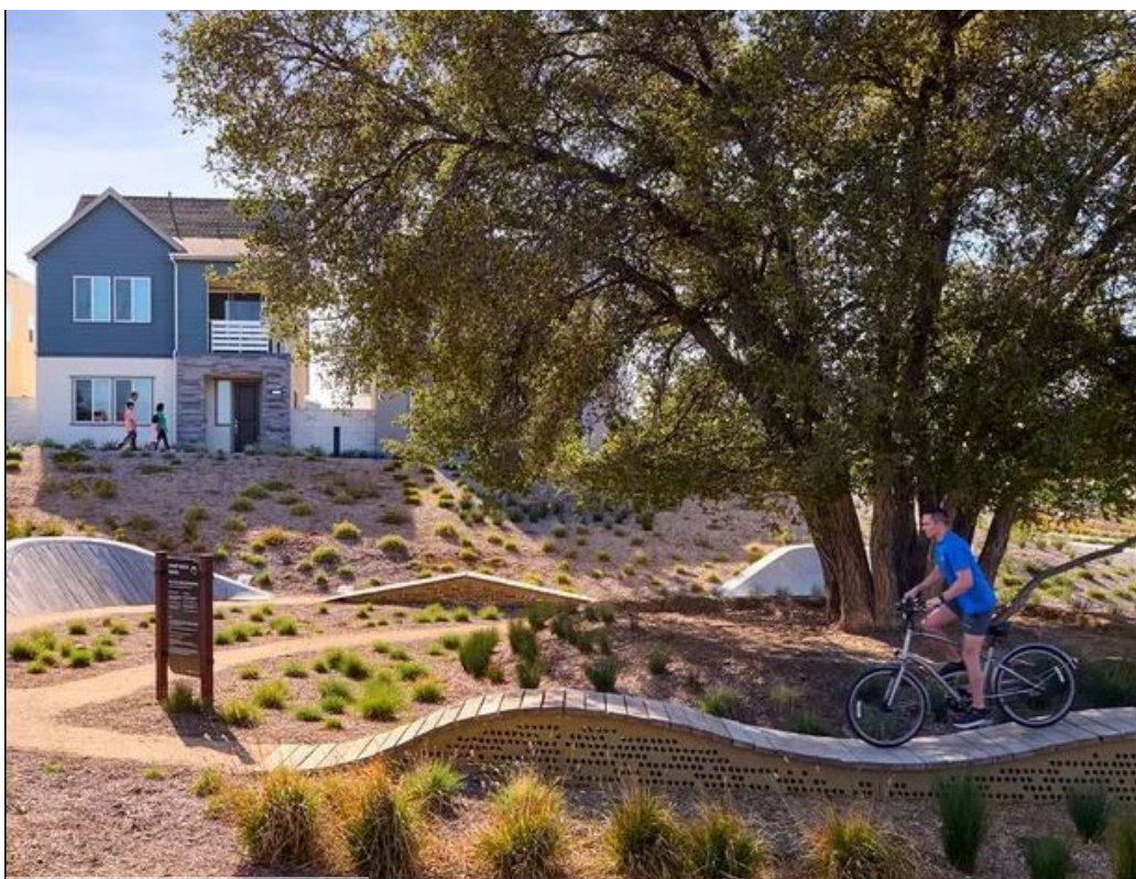
BIKE SKILLS COURSE