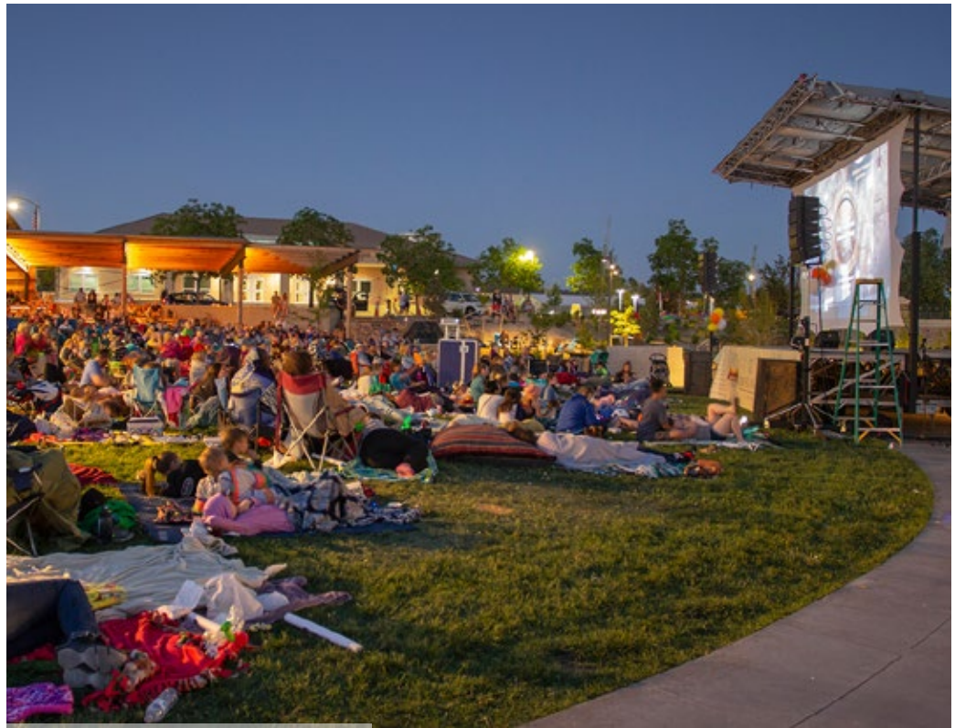
MUSIC / SPECIAL EVENTS