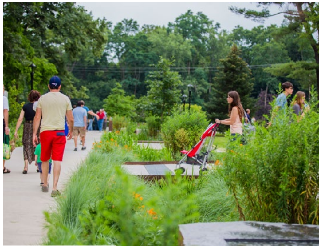
NATIVE GARDEN WALK