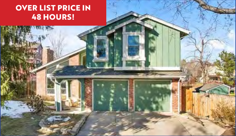
11413 W. Sharkstooth Peak CIMARRON Fantastic 5 bed, 4 bath with PREMIER LOT in a Cul-de-Sac that backs to Greenbelt!