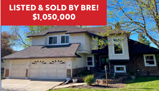
5 Sycamore Lane LEGACY