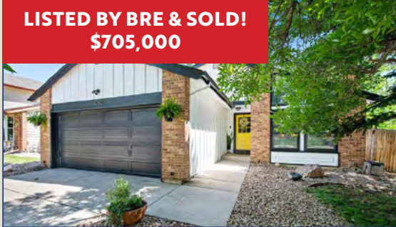
11090 W. Pyramid Peak VILLAGE