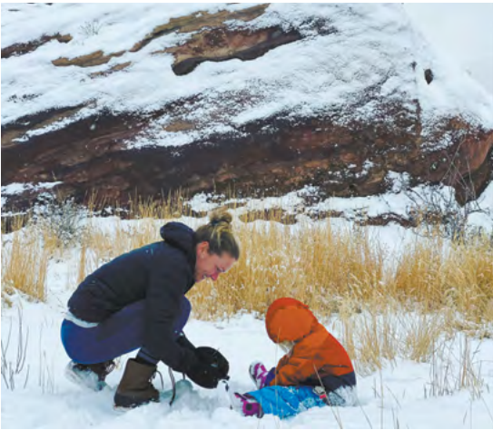
Below: It's a family affair. The author and her family spend quality time outdoors.