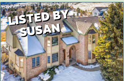
87 Deerwood Drive $1,800,000 DEERWOOD VISTA