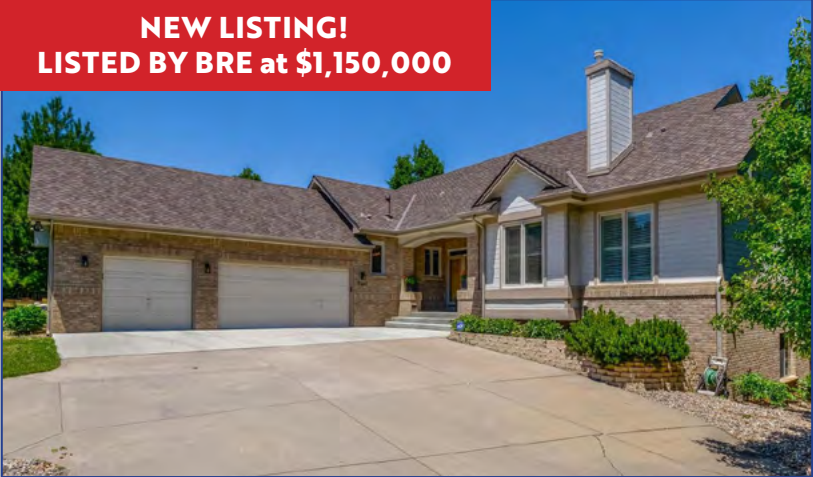
7515 S. Anvil Horn THE SPREAD RARE RANCH FLOORPLAN in the Spread with UPDATED Kitchen & Primary Bath! 5 bed, 4 bath AND Corner Lot in a Cul-de-Sac!

NEW LISTING! LISTED BY BRE at $1,150,000