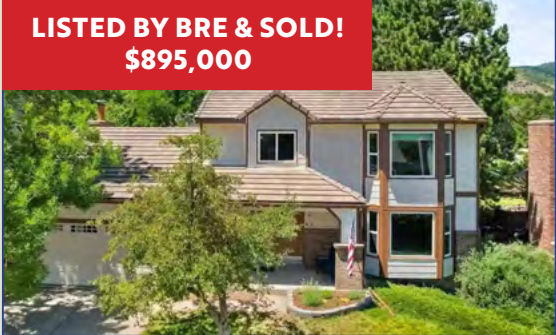
11 Red Locust TRADITIONS