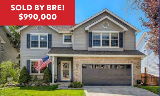
45 Blue Sage SHAFFER HILL