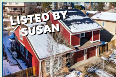
11355 Last Dollar Pass $840,000 VILLAGE