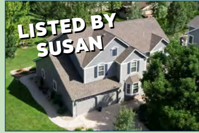
9 Summit Cedar $1,370,000 WYNTERBROOKE