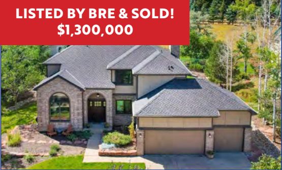
5 Green Spruce BRADFORD PLACE