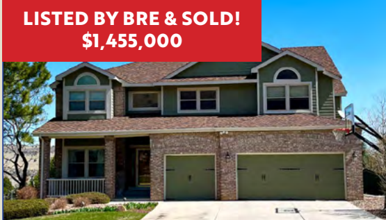
12 Mountain Alder BRADFORD PLACE