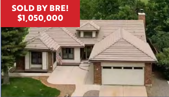
2 Canyon Cedar HEIRLOOM