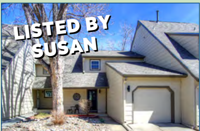
10413 Red Mountain $516,500 SETTLEMENT