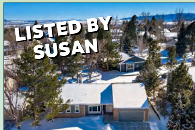
10282 Spread Eagle Mtn. $720,000 ASPEN MEADOWS