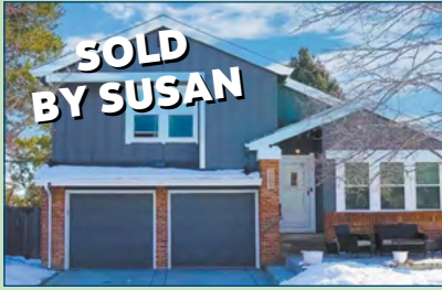
8160 Storm King Peak $730,000 VILLAGE