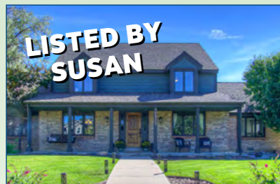
10920 Park Range Road $1,042,035 SPREAD