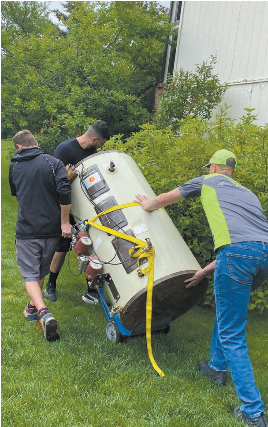
The Gone for Good crew in action!