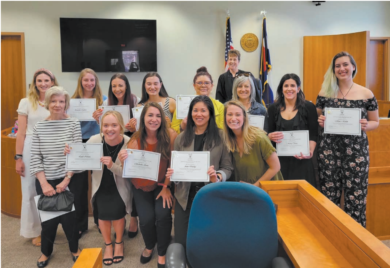
A recent CASA trainee class sworn in by a judge in Jefferson County.

Children who have CASA volunteers typically spend less time in foster care, receive more services needed to heal and perform better academically. CASA volunteers advocate first and foremost for reunification with the child’s family. When there is not an able or willing