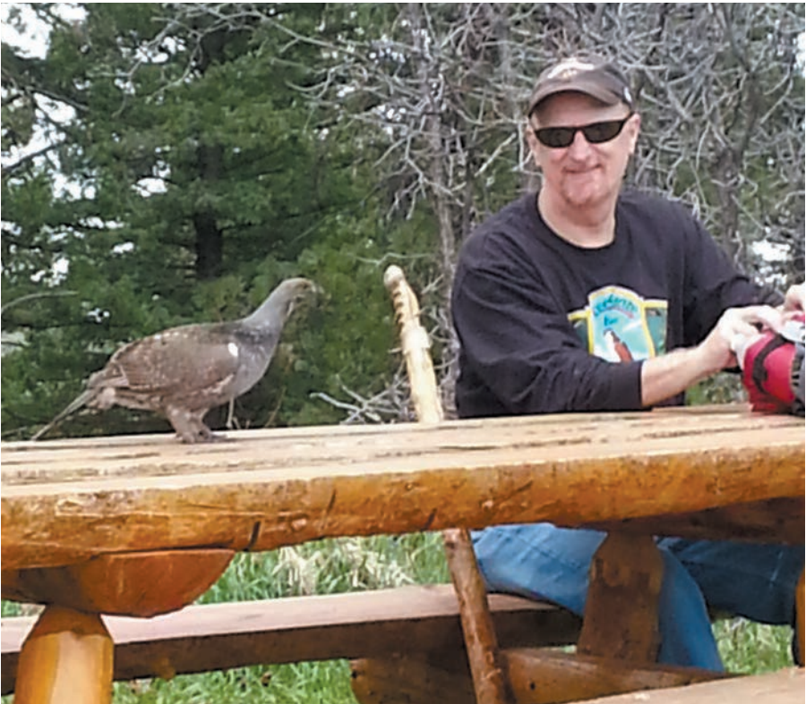
Oscar the Grouse struts his stuff. Residents are reminded that grouse are relatively harmless and should be left alone.