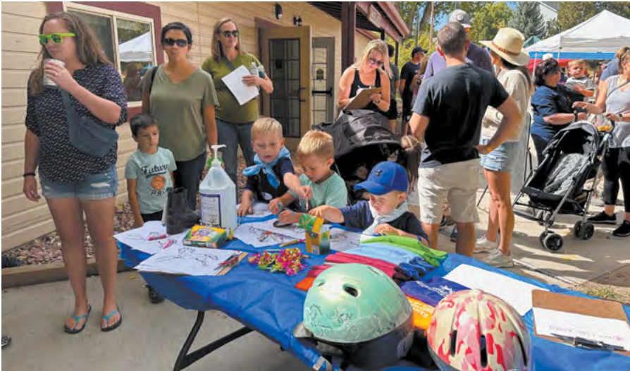
Attendees at this year’s Barn BrewHa event on Sept. 23.