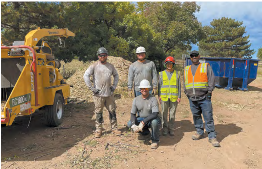
The KCRMD Parks crew chipped SLASH at this year's SLASH Drop-Off Event at the Equestrian Center on Sept. 30.