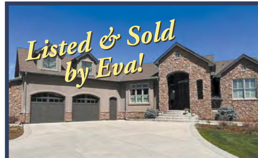
DEER CREEK MESA

Your Ken-Caryl Neighbor and Friend — Never Too Busy for Your Referrals!