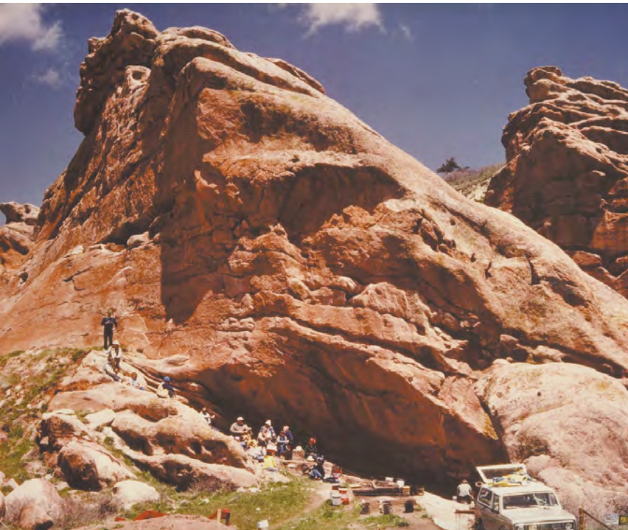
History in the making: Archaeological Dig in Progress in Ken-Caryl Ranch, 1976-1979.