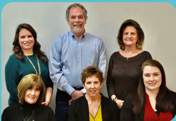
The HBS Team