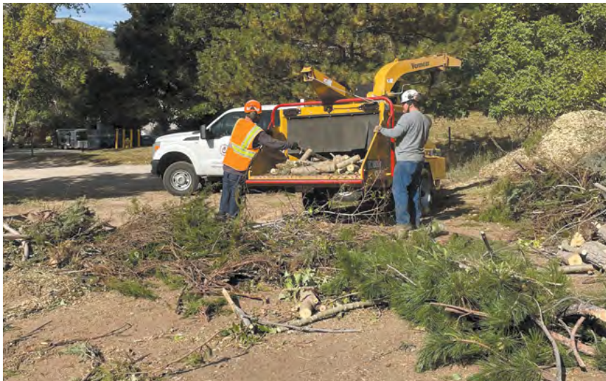
The KCRMA Rangers worked two SLASH curbside pick-up days last month to collect SLASH from resident's homes.

A special thanks to all residents who participated in this event to support fire mitigation efforts in our community and to our incredible KCRMA Open Space and KCRMD Parks teams for all of their hard work during this three-day event!