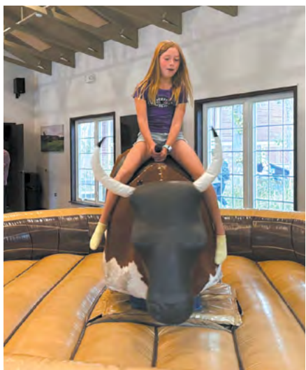
Once again, mechanical bull rides were a hit at this year's event!