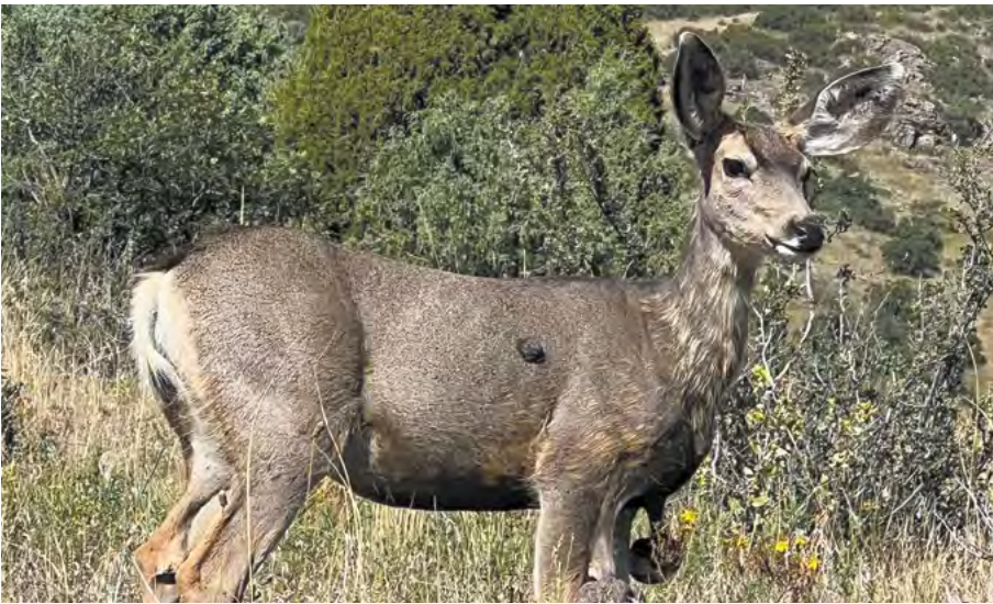
Deer shown with harmless deer fibromas.