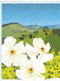
RIDGE 1™ KEN CARYL

Art inspired by your home, for your home.