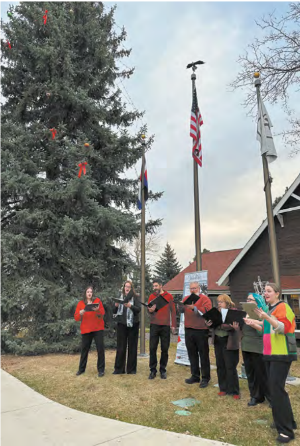
Summit Sounds of Voices West entertained guests at the event.