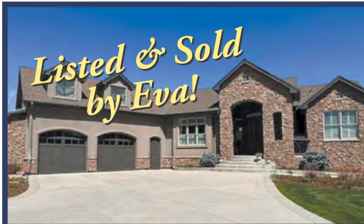
DEER CREEK MESA