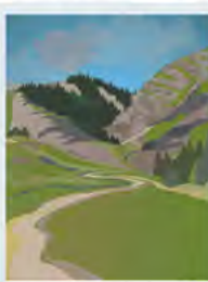
MASSEY DRAW KEN CARYL VALLEY