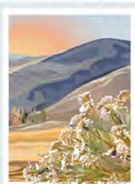
KEN CARYL VALLEY LITTLETON, COLORADO