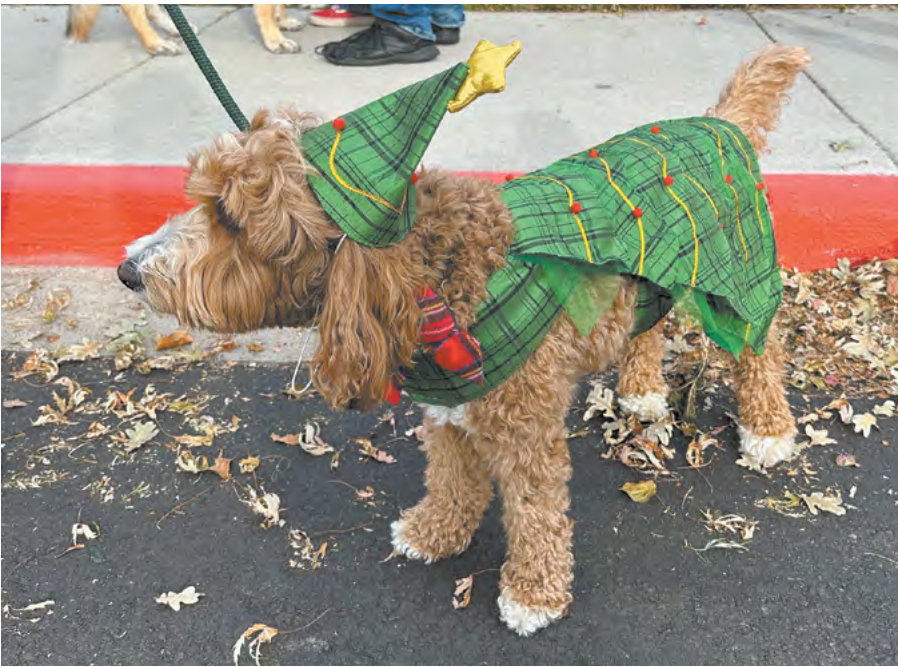
Top Dog Honors! This pooch was deemed Most Festive Dog at the event by Platinum Sponsor Eva Stadelmaier.