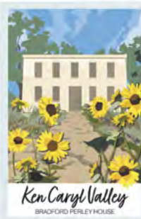
Ken Caryl Valley BRADFORD PERLEY HOUSE