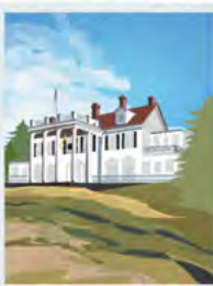
MANOR HOUSE KEN CARYL VALLEY