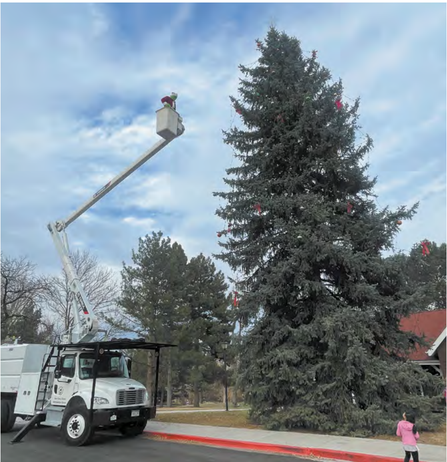
The Grinch places ornaments made by residents on the big tree at the Ranch House at this year's Inaugural Holiday Dog Parade and Tree Lighting Event in November.