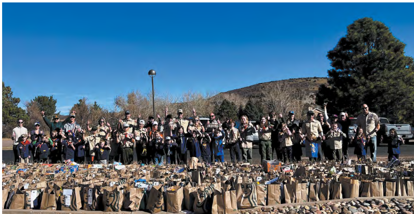
Members of Pack 742 spread holiday cheer and goodwill during their holiday food drive.