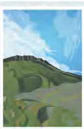
KEN CARYL VALLEY LITTLETON, COLORADO