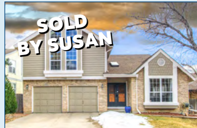
7744 Gunsight Pass $830,000 CIMARRON