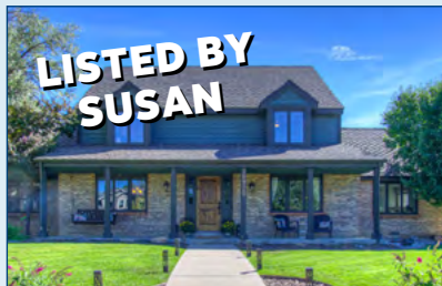
10920 Park Range Road $1,042,035 SPREAD