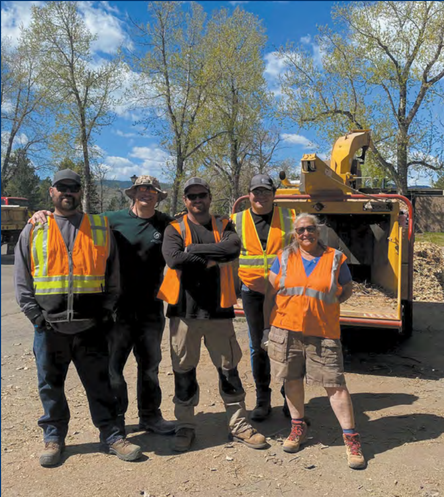
Members of the Parks Department were on hand with their chipper at this year's event.