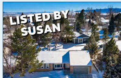
10282 Spread Eagle Mtn. $720,000 ASPEN MEADOWS