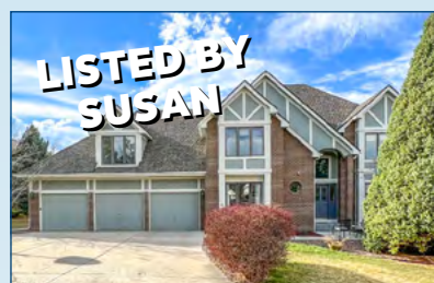
7591 S Dome Peak $1,200,000 SPREAD