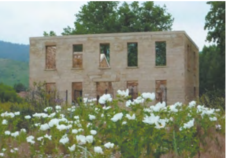
The Bradford-Perley House