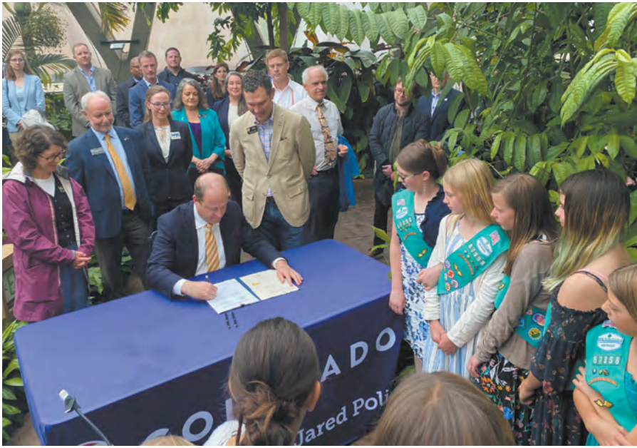
Colorado Gov. Jared Polis speaks during a signing ceremony for Senate Bill 23-16, meant to reduce greenhouse gas emissions, at the Denver Botanic Gardens on May 11. Members of local Girl Scout Troop 67358, who testified in favor of the bill, were invited to attend the event.