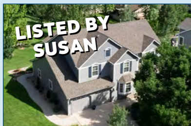
9 Summit Cedar $1,370,000 WYNTERBROOKE