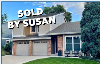
1170 W Twin Thumbs $805,000 VILLAGE