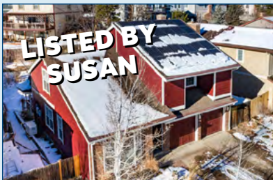
11355 Last Dollar Pass $840,000 VILLAGE