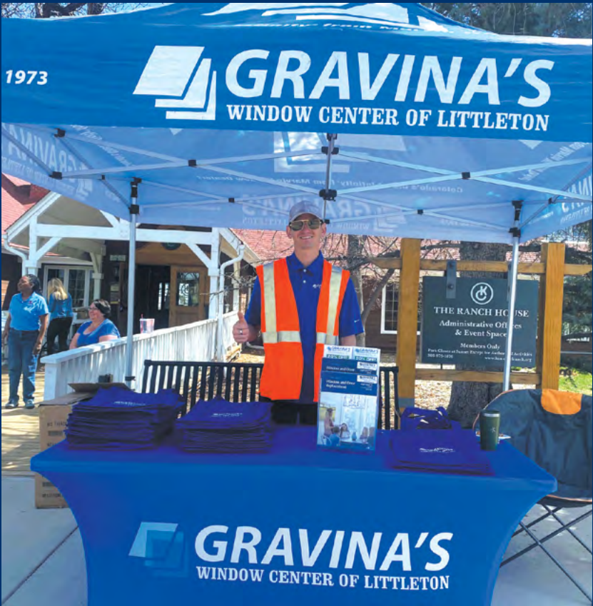
Platinum Sponsor Gravina's Window Center of Littleton was a sponsor at this year's event, providing giveaways and assisting residents.