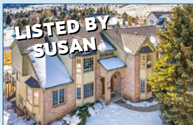
87 Deerwood Drive $1,800,000 DEERWOOD VISTA