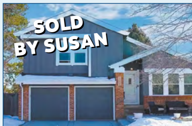
8160 Storm King Peak $730,000 VILLAGE