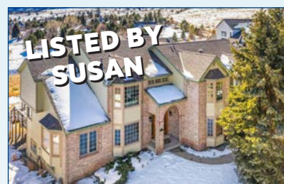
87 Deerwood Drive $1,800,000 DEERWOOD VISTA