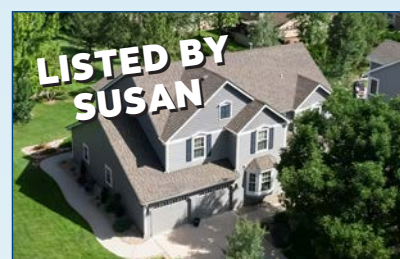
9 Summit Cedar $1,370,000 WYNTERBROOKE