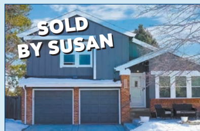
8160 Storm King Peak $730,000 VILLAGE