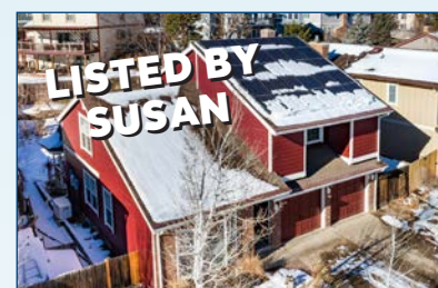
11355 Last Dollar Pass $840,000 VILLAGE