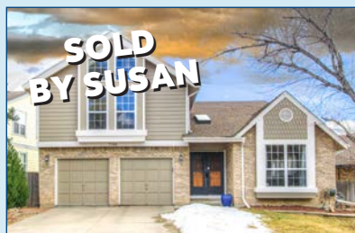
7744 Gunsight Pass $830,000 CIMARRON