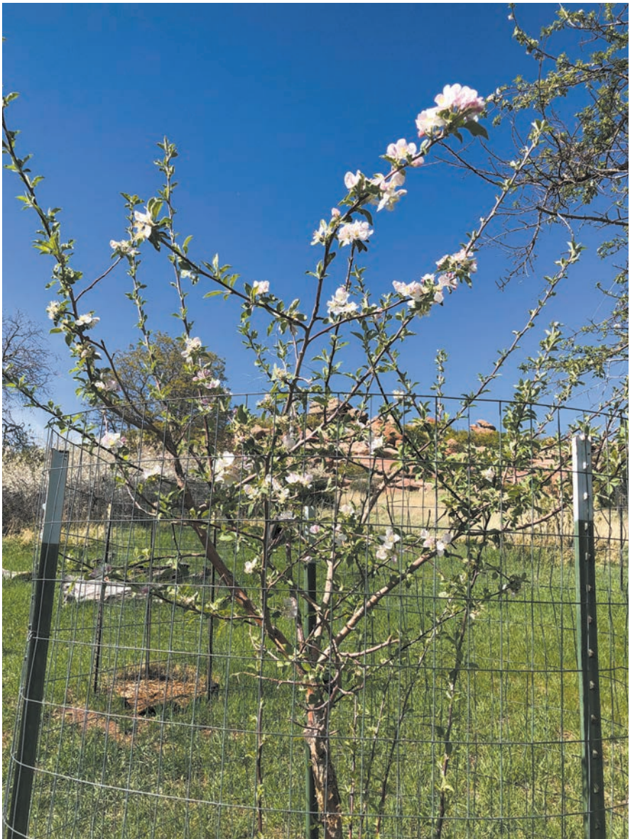
The Braford-Perley House apple orchard.