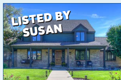
10920 Park Range Road $1,042,035 SPREAD