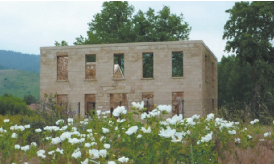
The Bradford-Perley House

During your visit, be sure to take time to stop and smell the flowers – literally! Guests are welcome to visit the Bradford-Perley apple orchard and see what’s growing in the garden on display for visitors, which should be bursting with vibrancy and color in June!