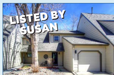
10413 Red Mountain $516,500 SETTLEMENT