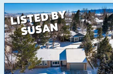
10282 Spread Eagle Mtn. $720,000 ASPEN MEADOWS