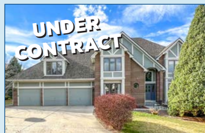
7591 S Dome Peak $1,200,000 SPREAD