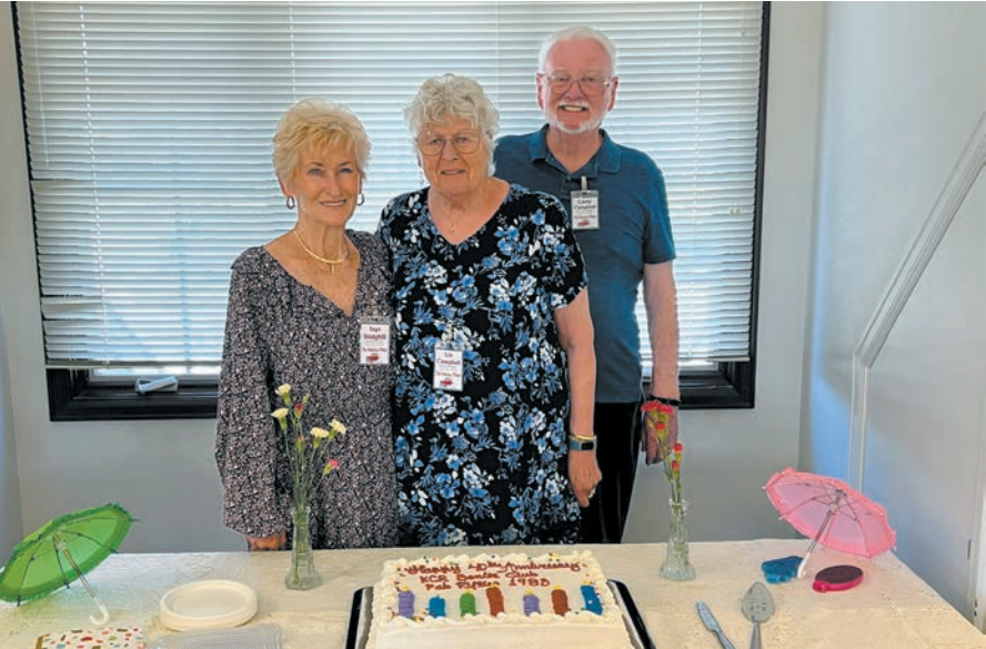
Members of the Senior Club celebrate their 40th Anniversary