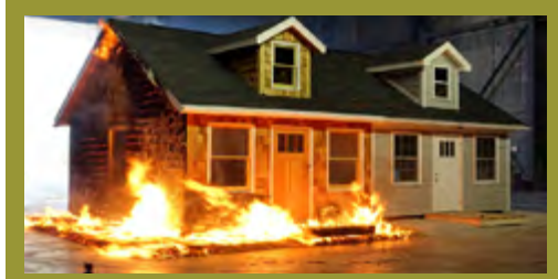
Figure 1 – Creating and maintaining home ignition zones (defensible space) around your property are proven ways to reduce risks of property damage during a wildfire, as tests at the IBHS Research Center have shown.