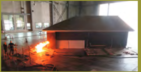
Figure 2a Experiments conducted at the IBHS Research Center to study the effectiveness of creating a noncombustible space around buildings.