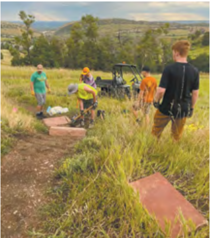
Members of the Trail Club hard at work placing stone slabs to protect the historic Shaffer Ditch.