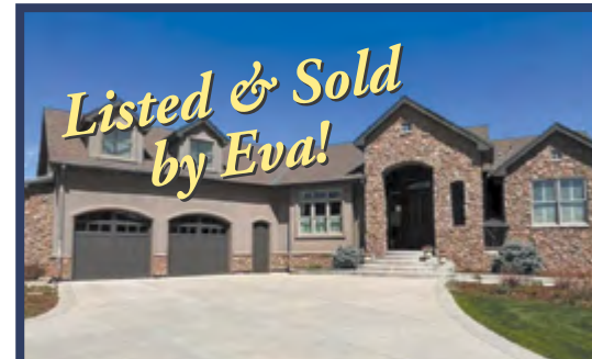
DEER CREEK MESA