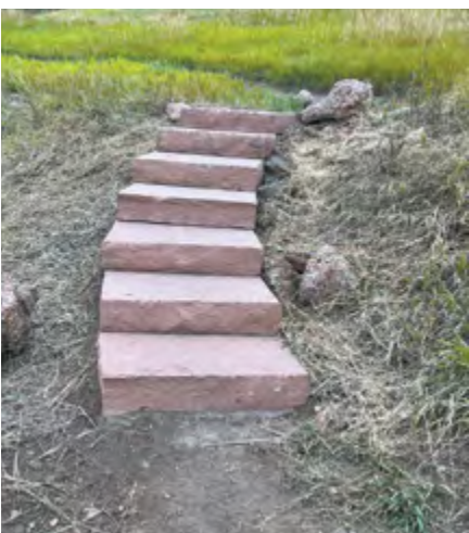
The stone slabs that protect the Shaffer Ditch following the project's completion.