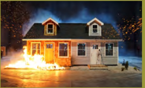
Figure 2b Embers impacting a building: left side with combustible (wood) and the right with noncombustible (rock) mulch.