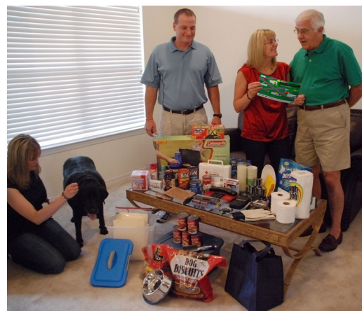
Prepare an emergency bag of personal items.

For more information and free fire-safety resources, visit www.usfa.fema.gov .