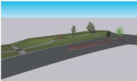
Ken-Caryl Ranch Sidewalk Extension Project